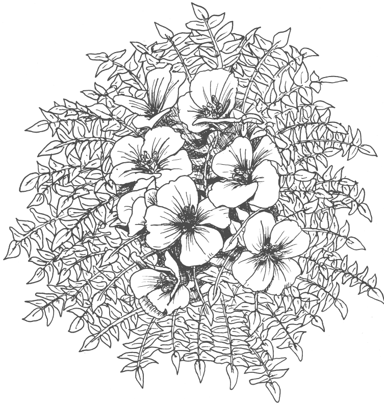
Morisia monanthos 'Fred Hemingway'

OPENING TIMES 2026: 10 th March 2026 to 24 th September 2026 Tuesday – Saturday: 10am-4pm